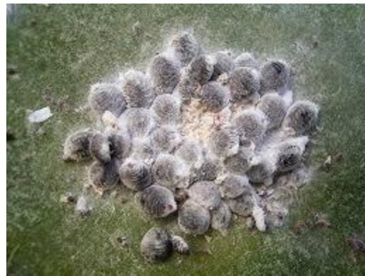
Silver grain - Cochineal