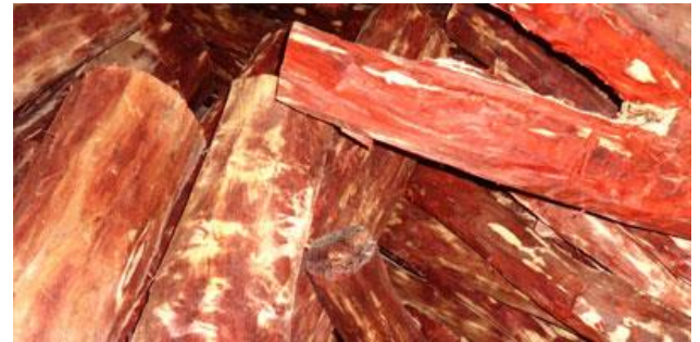
RED SANDERS WOOD